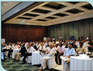
▲ The audience during the Conclave