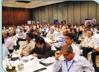
▲ During the Conclave.