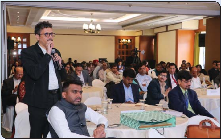
Participants engaging in an insightful Q&A session during the Nourish India 2025 Summit, raising critical points on food safety, innovation, and sectoral challenges