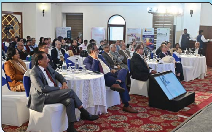
Ei duo footfall at the conference