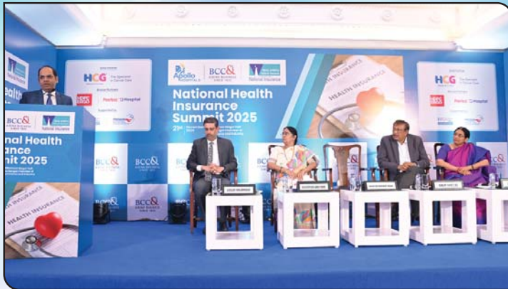
Opening Session in Progress