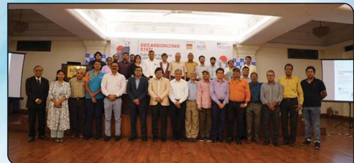
Group Photograph of Participants Participants, experts, MSME representatives, industry leaders, and organisers came together for a group photo at the multi-stakeholder event on “Decarbonizing Steel,” hosted at Williamson Magor Hall, The Bengal Chamber.