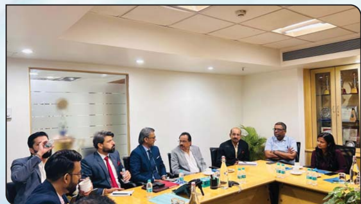
Glimpses of the Business Roundtable with the High Commission of Canada in India on 31 st October 2025, Infinity premises featuring the Members of Canadian High Commission in India and Leaders of Indian IT Enterprises