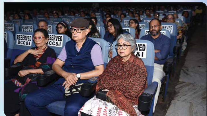
Senior representatives of The Bengal Chamber present at the Aranyer Din Ratri film screening at Priya Cinema on 7th November 2025