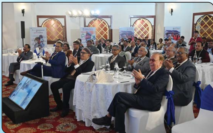
Footfall at the Conference

15 th November 2025, Taj Ambassador, New Delhi