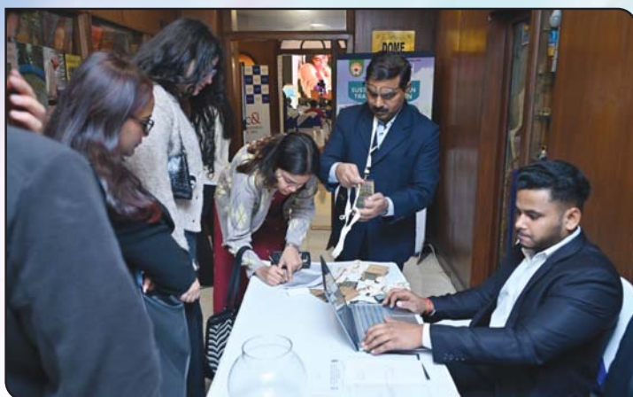
Registration at the Venue