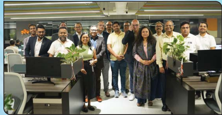
Glimpses of the Strategic Interactive Session with Aixolotl AG, 30 th October 2025 at Redoq Premises featuring the Leadership of Aixolotl AG and Industry Leaders of Bengal