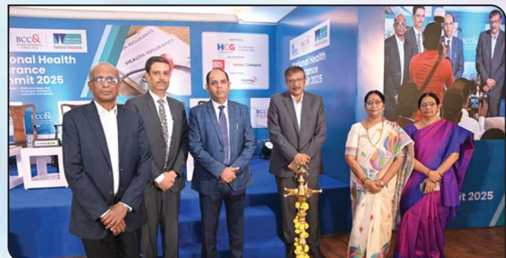
Inauguration with lamp lighting ceremony