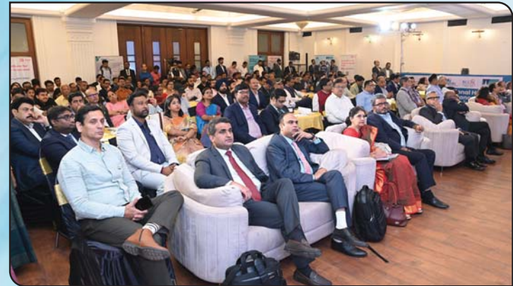
Audience at the venue