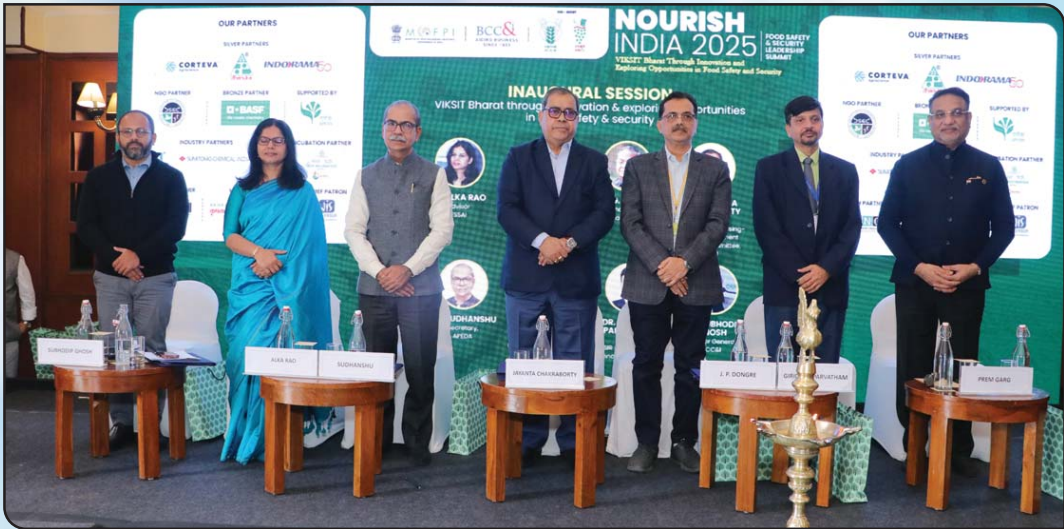
All dignitaries of the Inaugural Session of the Nourish India 2025 – Food Safety & Security Leadership Summit, standing together to mark the beginning of a national dialogue on innovation, safety, and export excellence in food systems