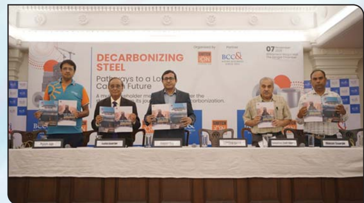
Launch of the Reports on India’s Low-Carbon Steel Sector