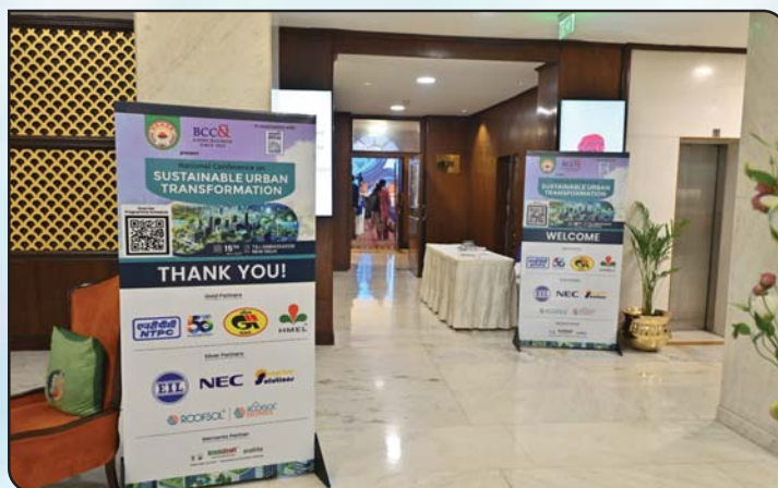
Branding at the Venue