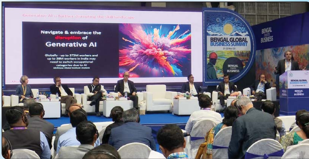
Section of the Audience during the Sectoral Session

THE BENGAL GLOBAL BUSINESS SUMMIT (BGBS 2023) - SECTORAL SESSION ON FUTURE SKILLS