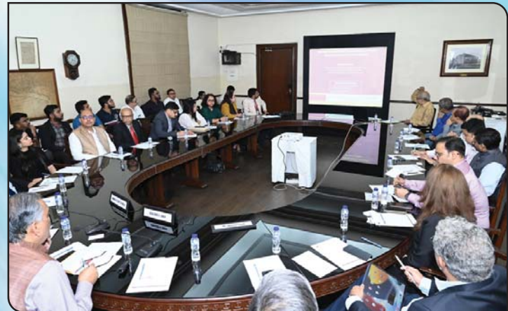
Round Table Session on Healthcare with US Consulate General in progress