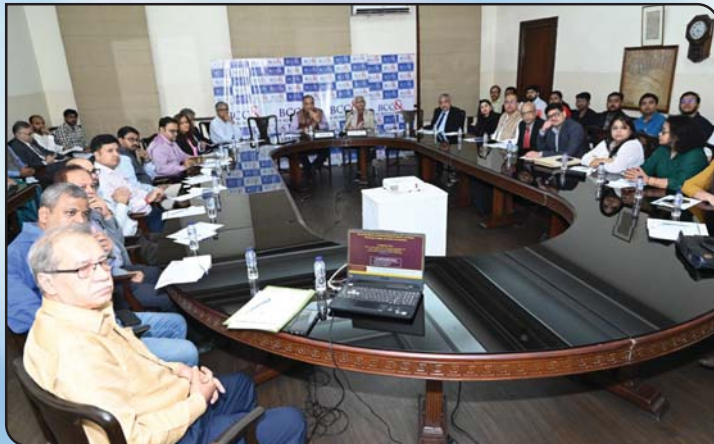
Round Table Session on Healthcare with US Consulate General in progress

The Round Table Session was followed by Q/A Session with the audience. The Session was attended by close to 50 delegates.