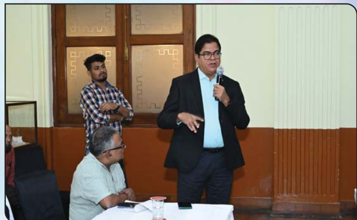
Distinguished audience asking questions