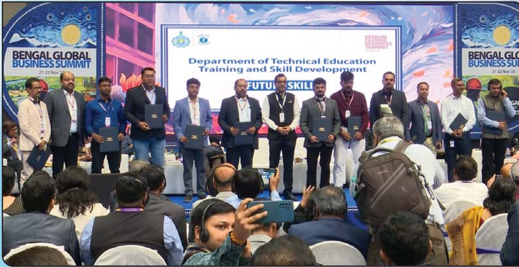
MoU signing Ceremony

22 nd November 2023 The Biswa Bangla Mela Prangan