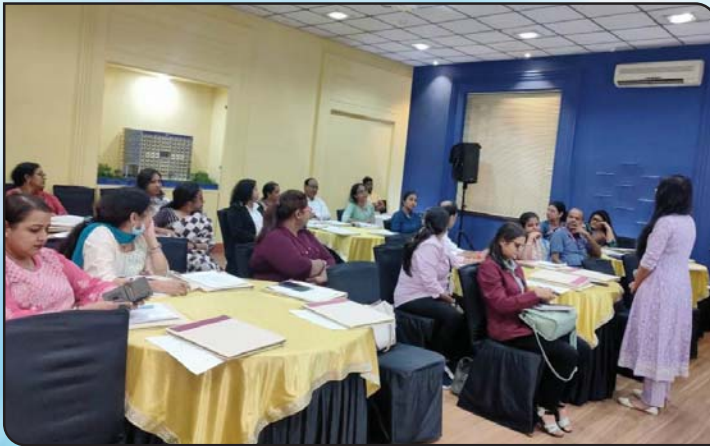
The workshop in progress

7th November 2023 The Bengal Chamber Premises