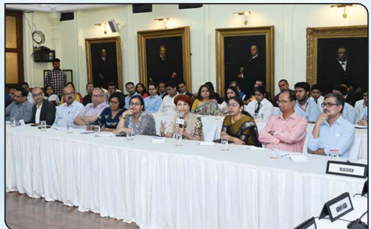
Distinguished audience asking questions