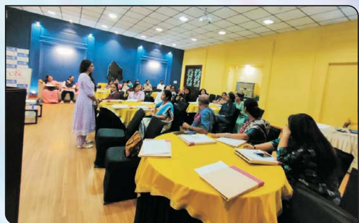
The workshop in progress