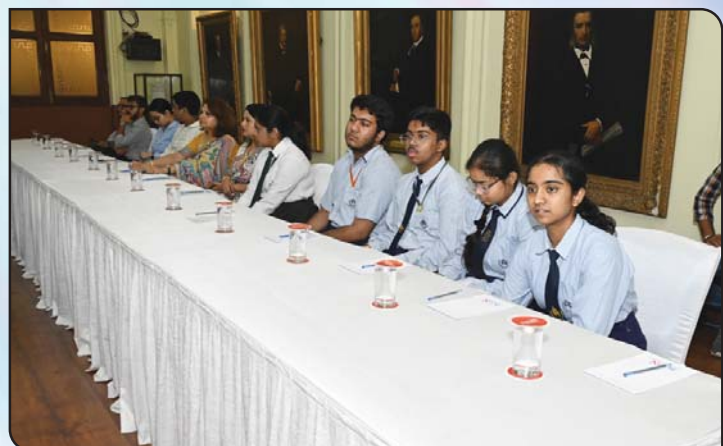
Students attending the programme