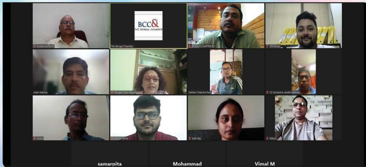
One of the sessions on ESG Certification Course

BCC&I partnered with Dun & Bradstreet to bring an exclusive online certificate course on Environmental, Social, and Governance (ESG) practices from September 09, 2023 - October 07, 2023). The certification program is delivered by experienced Dun & Bradstreet trainers. The program uses a case study-based approach and helped participants to get a detailed understanding of best international practices related to ESG. The certification program has industry-relevant case studies covering the ESG framework. Participants would get exposure related to key data points used in preparing the ESG report. The program helped them to understand how they can contribute to building ESG compliance businesses.