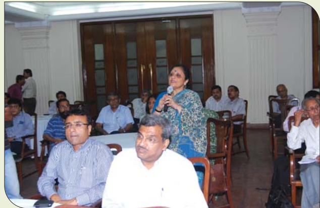
Section of the audience during the interaction with the Minister.

The feedback from the session was very positive as it helped the delegates present to interact with the Minister directly and share their problems and expectations