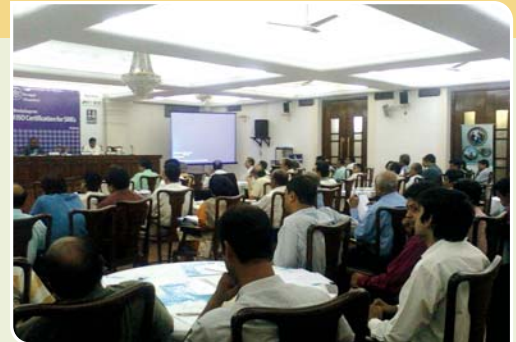
The workshop in progress.