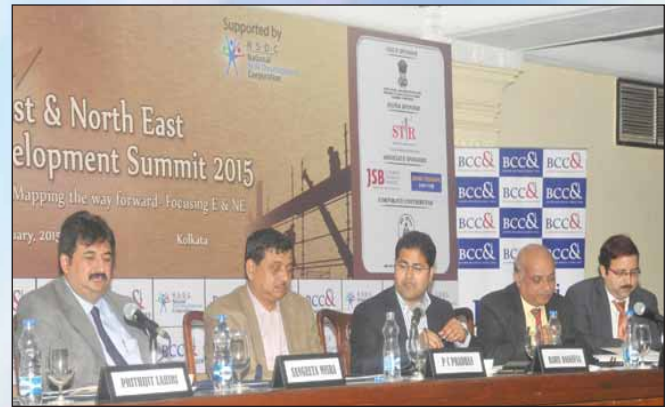
Speakers at Session I – Experts’ Roundtable on “Opportunities and Challenges in Skill Training.