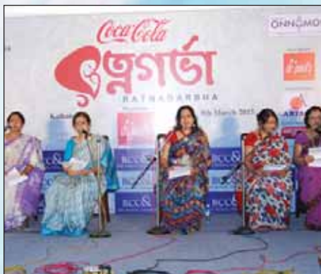
Members of Ananya Onnomon performing at the event.