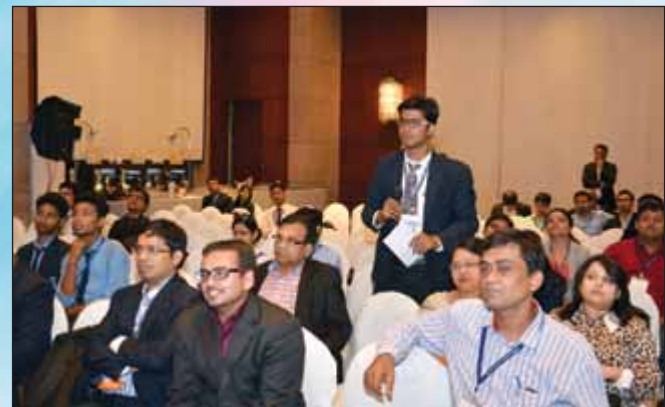
The audience raises a point.