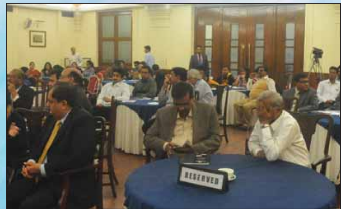
During the Summit.