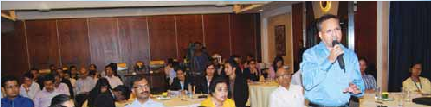
The Q&A round.