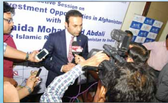
Meeting the press.