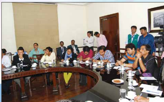
The press in attendance.