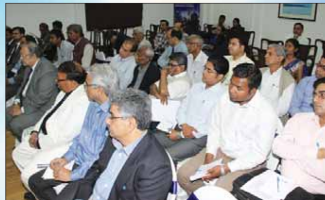
The delegates present.