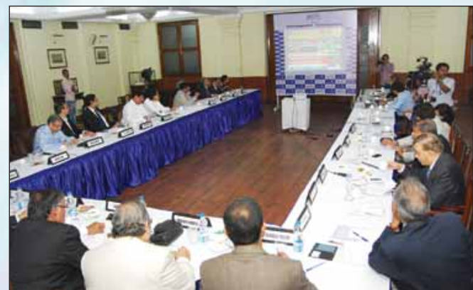
Viewing Session of the Union Budget 2015-16 in progress.