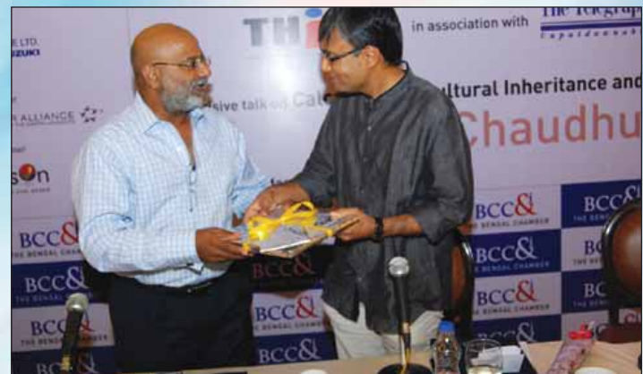
A section of the audience.