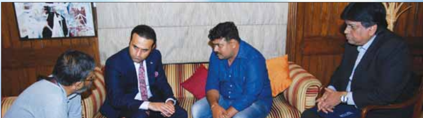
The Ambassador with some of the delegates and the media at the Palladian Lounge.