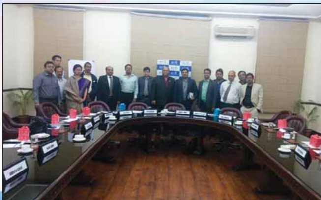
Newly Formed Friends of IT (FIT) Committee.