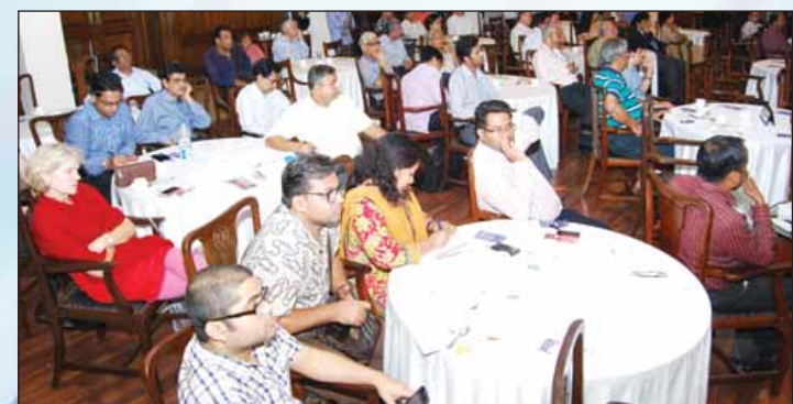
A cross section of the audience.