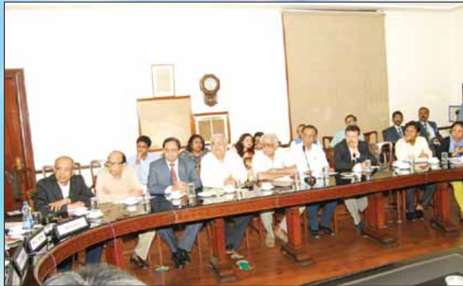
A section of the audience at the ITC Room, The Bengal Chamber.

scenario in the country. Afghanistan currently has its own army; institutions and mechanisms had been rebuilt after the historic elections and a new Government had come into power. India is a key strategic partner of Afghanistan. The specific scopes of business opportunities commencing with partnerships between the Chambers of Commerce were talked about.