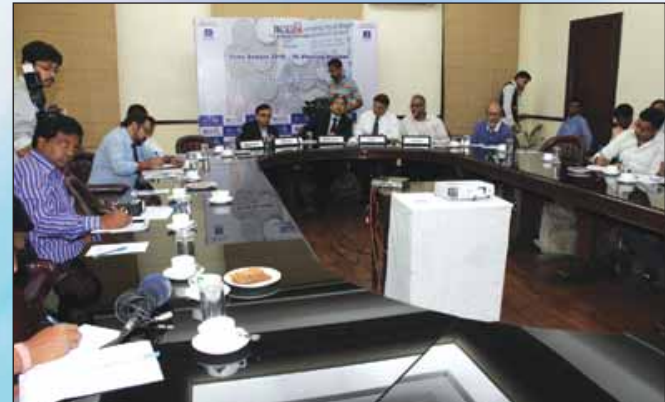
Viewing Session of the State Budget in progress.