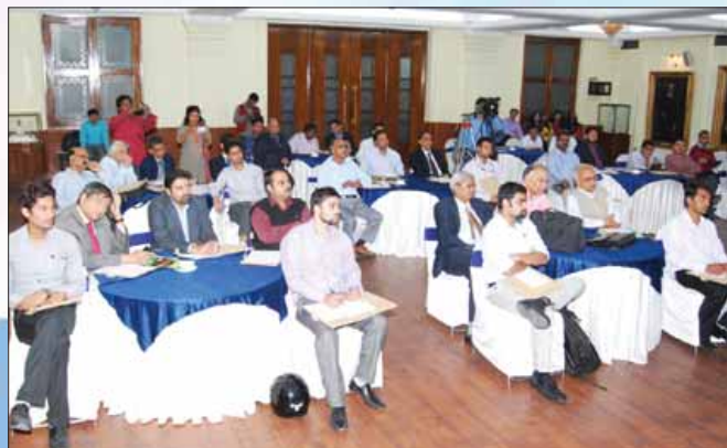
Participants at the India Eurasia Business Partnership Seminar