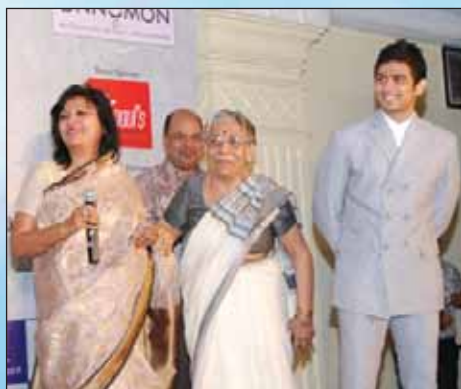
Grandmother of Shri Sourav Ghosal during the award ceremony.