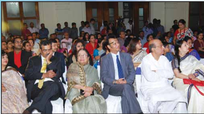
Section of the distinguished audience.