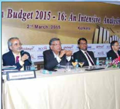
Q/A Session in progress.