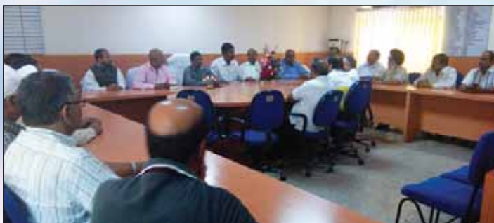
The meeting at the Rourkela Chamber of Commerce and Industry.