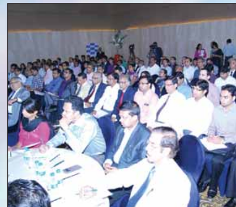
A full house.