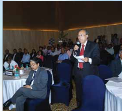
Q/A Session in progress.