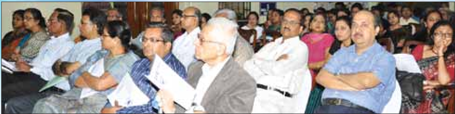
Section of the audience.