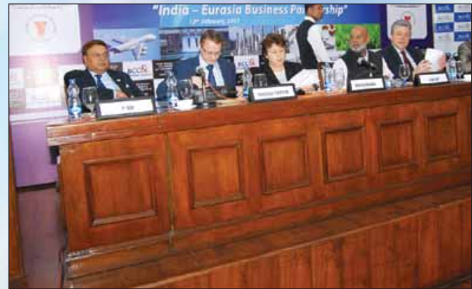
Industry representatives from Exide, USD HR Solutions, SAIL, etc who participated in this meet.