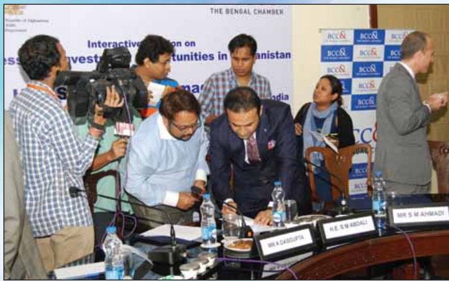
The Ambassador with the media.