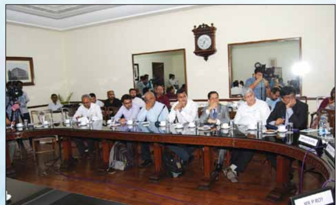
A section of the audience.