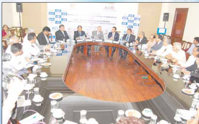
The interactive session with the Ambassador in progress.