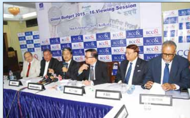
Media interaction in progress.