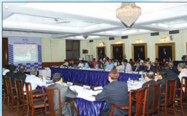
Viewing Session of the Union Budget 2015-16 in progress.