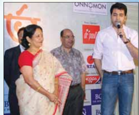
Shri Abir Chatterjee addressing the audience.