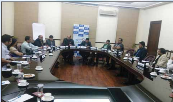
Interactions during the session.

It was a most successful session and based on the discussions at the meeting, initiatives are being planned to realize the objectives of FIT.