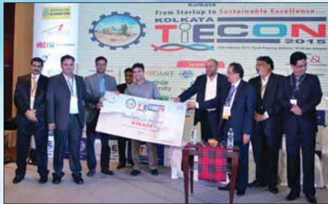
Winner of the Hot Pitch Award taking a gift cheque from the dignitaries.