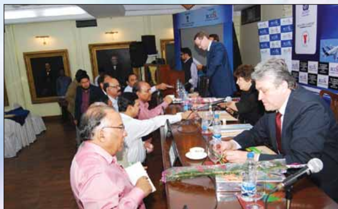
B2B meeting after the Inaugural Session.