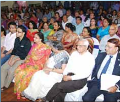
Section of the audience.