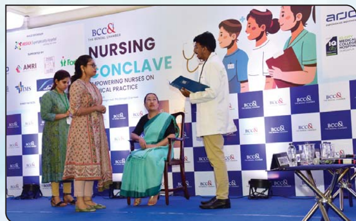
Role Play on 'Reacting Vs Responding: Does it going to make difference at the clinical scenario?'