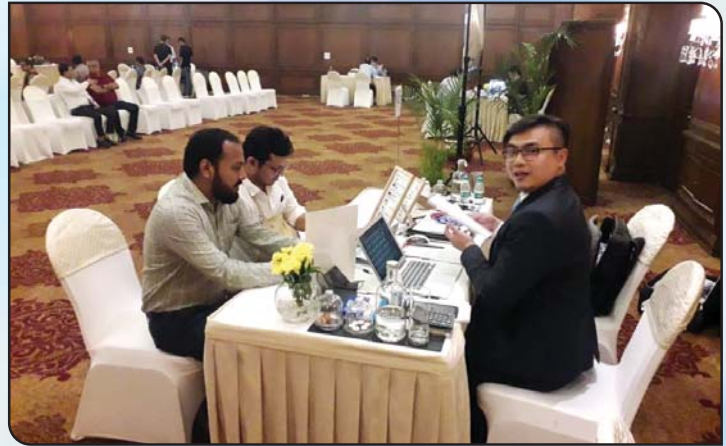
B2B Meetings in progress between Taiwanese suppliers and Indian Buyers