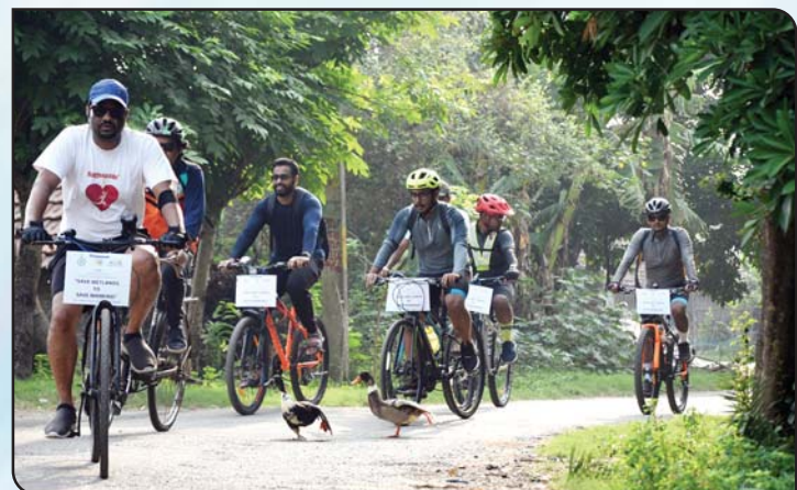
A section of riders passing through the Wetlands