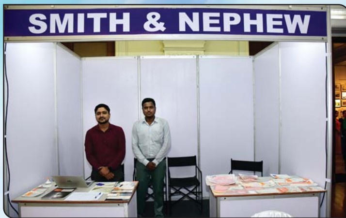
Exhibitor : Smith & Nephew