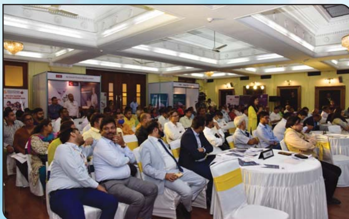
Participants at the Conclave

26 th May 2023, The Bengal Chamber premises