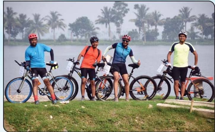
Tour Mid-Point at East Kolkata Wetlands (Chacker Bherry)

8 th and 9 th June 2023, Taj Bengal, Kolkata