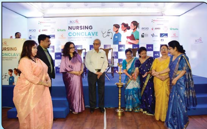
Inauguration with Lamp Lighting Ceremony

30 th May 2023, The Bengal Chamber premises