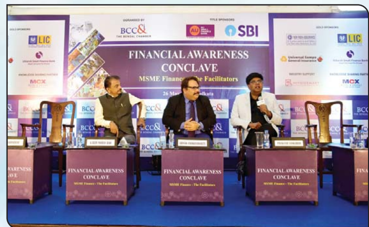
The eminent speakers deliberating on the Theme, 'MSME Finance : The Facilitators' at the Opening Session