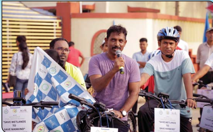
Special address by Shri Kaliyamurthi Balamurugan, IFS, Chief Environment Officer, Department of Environment, Government of West Bengal