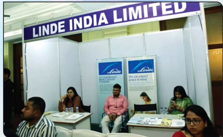
Exhibitor : Linde India Ltd