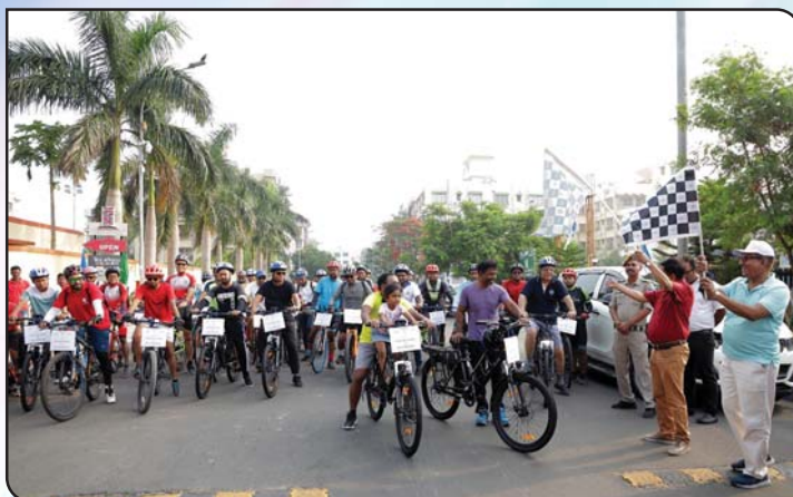
Dignitaries flagging off the second edition of BCC&I Pedal through Heritage