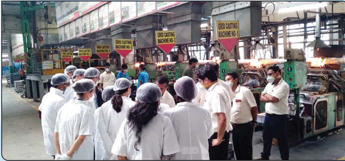
Factory visit in progress

B2B MEETINGS WITH THE BUSINESS DELEGATION FROM TAIWAN