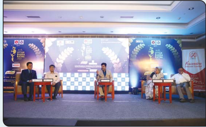
A panel discussion in progress before the felicitation ceremony