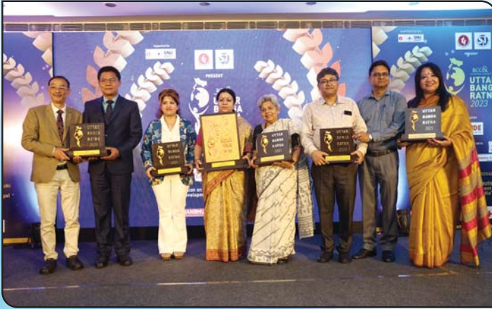
Awardees of the 2nd Edition of Uttar Banga Ratna