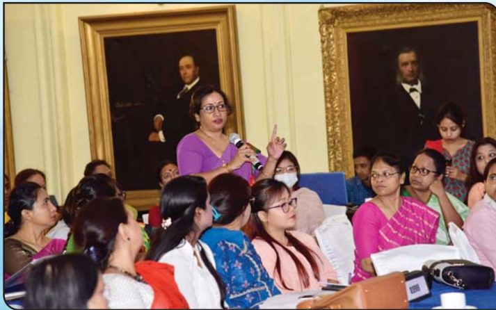
Q/A Session in progress

30 th May 2023, The Bengal Chamber premises