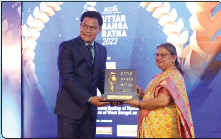
Award in Education Sector - St. Paul's School, Darjeeling