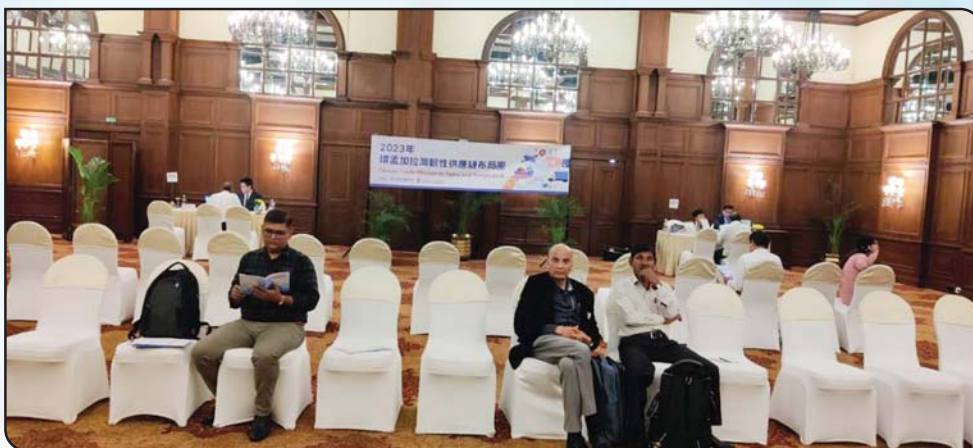
The Indian companies at the meeting venue for B2B Meetings with Taiwanese Companies