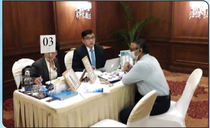
B2B Meetings in progress between Taiwanese suppliers and Indian Buyers