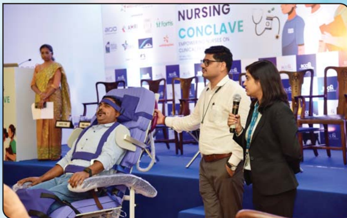
Live Demonstration of product by Arjo Huntleigh Healthcare India Pvt Ltd