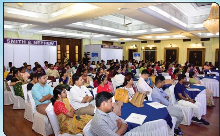
Audience at the Conclave