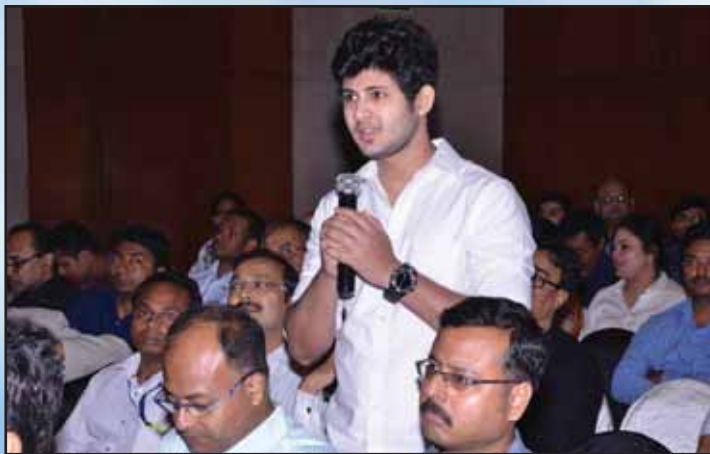
Q & A in progress