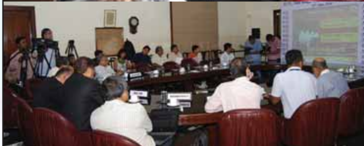
Viewing Session of the State Budget in progress