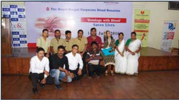
Team Vedic Village who had come all the way to donate Blood