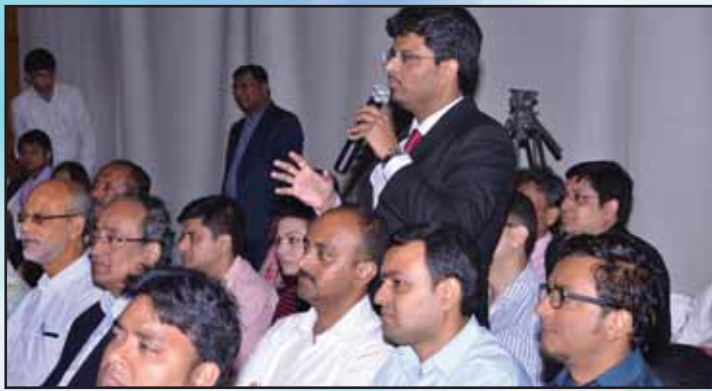
Q & A in progress