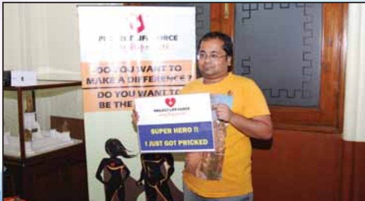
A Proud Donor