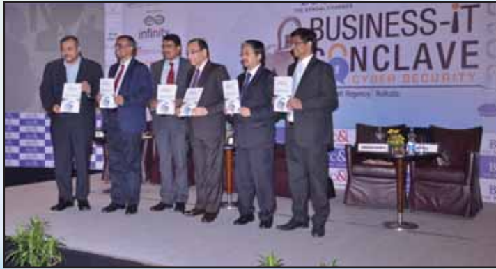
Launch of the cyber security thought paper