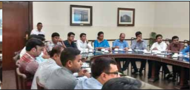
Participants during the workshop