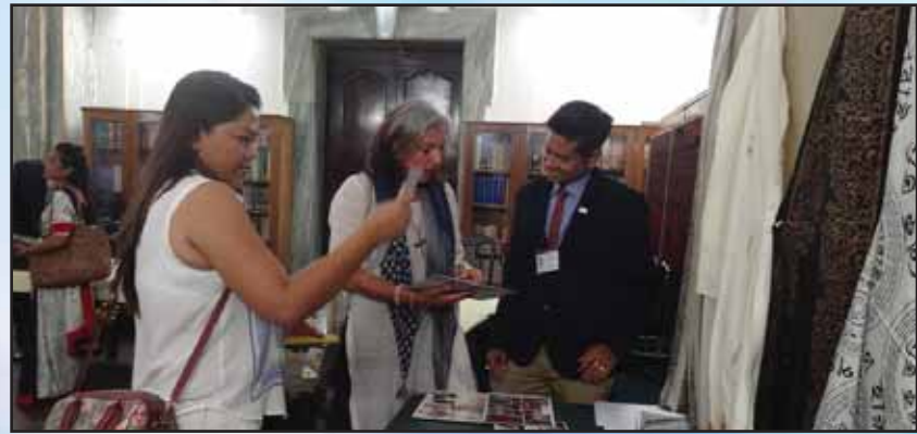
B2B Meetings in progress at Embassy of India in Rome