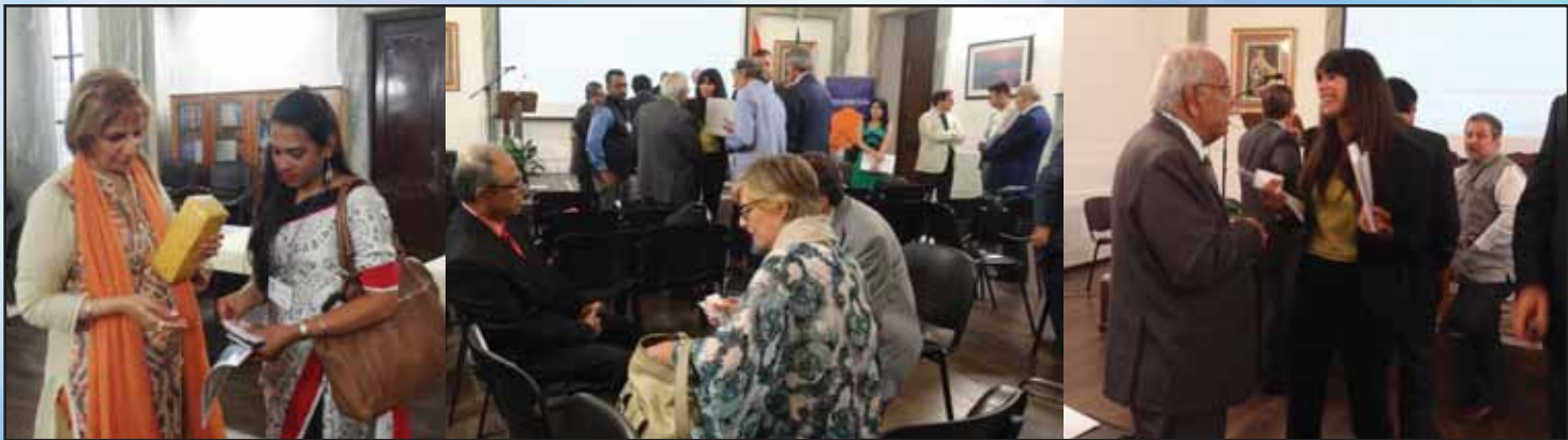
B2B Meetings in progress at Embassy of India in Rome