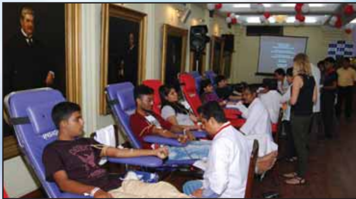
Blood Donation in progress