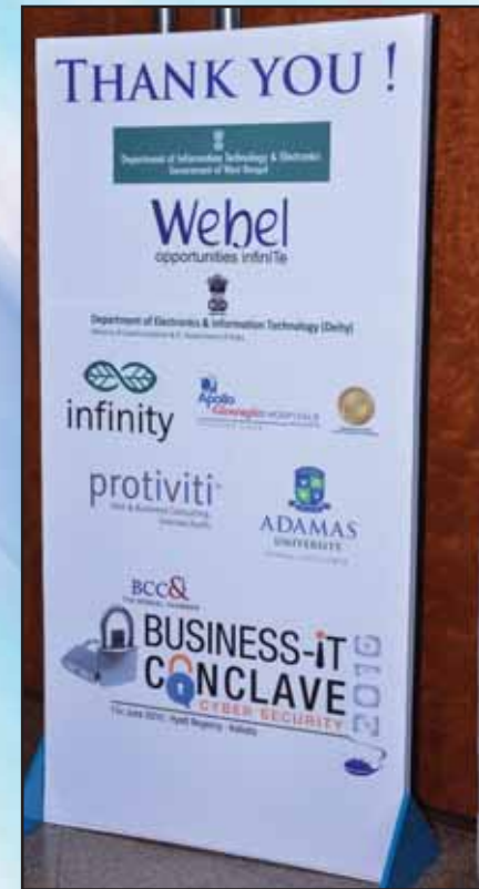
Thank You Sponsors

23rd June 2016 The Palladian Lounge, Chamber Premises