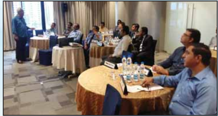
Delegates attending the programme