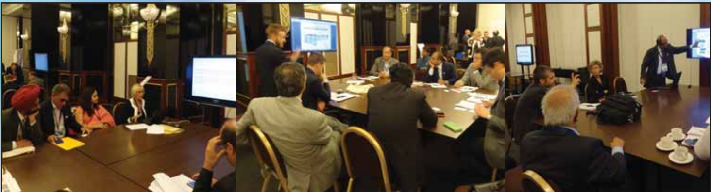
B2B Meeting is progress after Seminar on 'Indian Opportunities for Italian Companies'