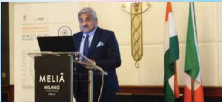
Ambassador Anil Wadhwa, Embassy of India in Rome addressing the Seminar on 'Indian Opportunities for Italian Companies'

The concluding day, 19th July 2016, was utilized for follow up and additional B2B Meetings.