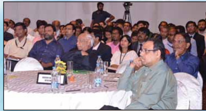
Cross section of the Audience