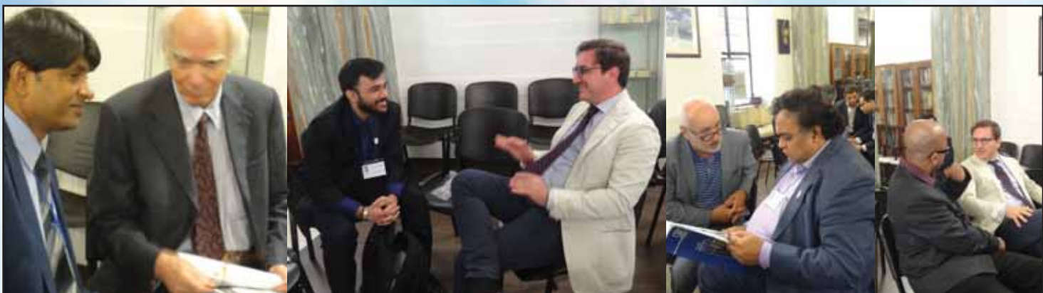
B2B Meetings in progress at Embassy of India in Rome