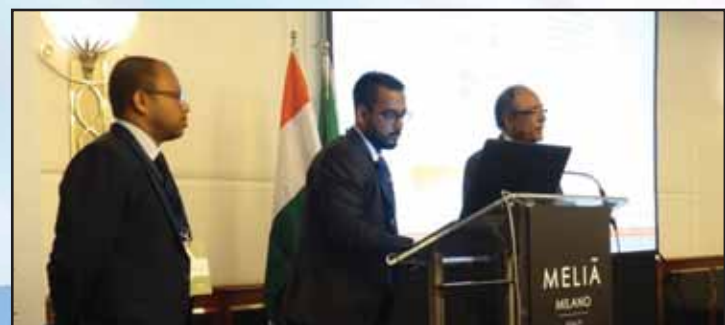
Introduction of Delegates