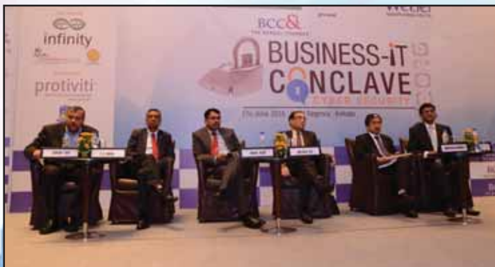
The Inaugural panel