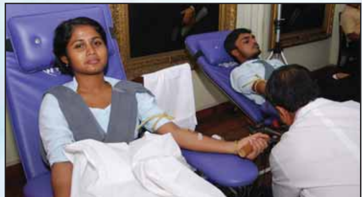
Students donating Blood