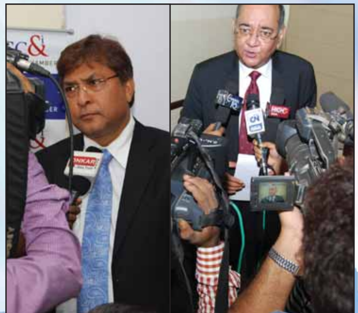
Media Interaction in progress