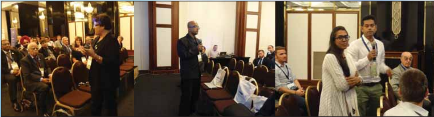
Introduction of Delegates