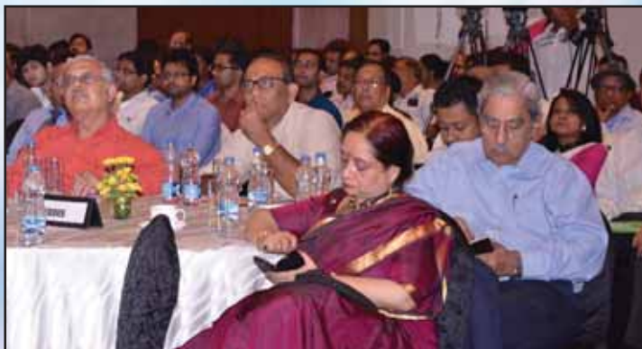
Cross section of the Audience