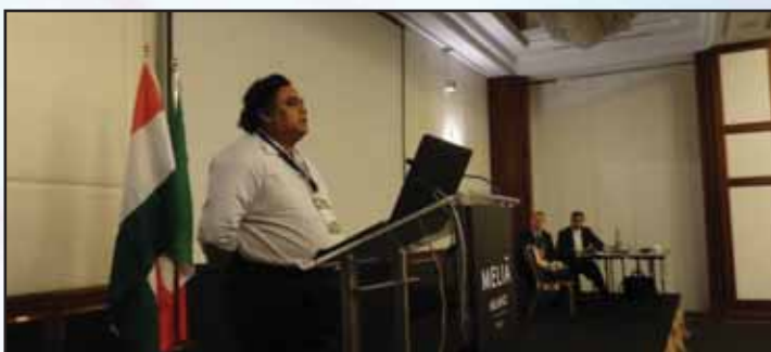
Introduction of Delegates