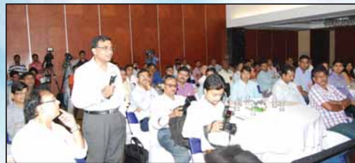
Q/A Session in progress