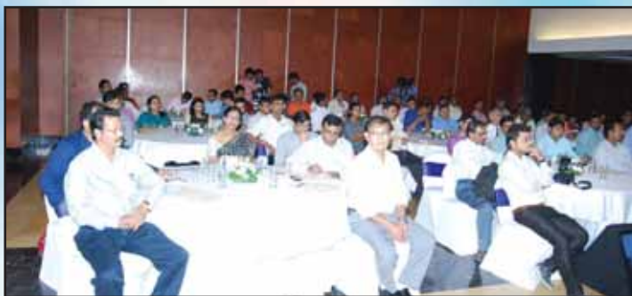
Audience at the Seminar