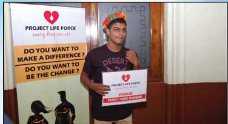
First time Donor