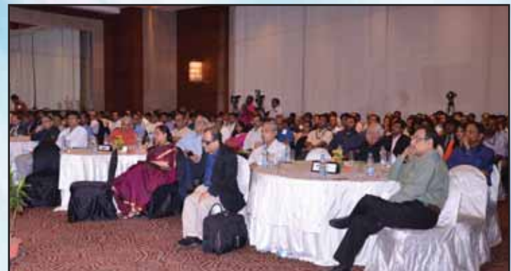
The hall in full capacity