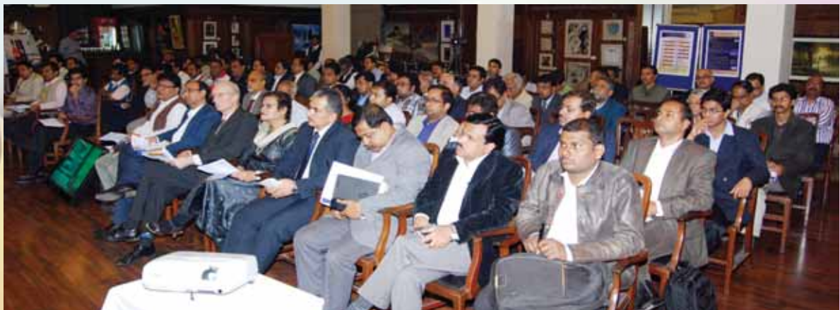
▲ The packed Lounge.

The focus of the discussions was on the challenges and opportunities for Indian IT businesses in the context of contemporary economic phenomenon, global politics, new and emerging markets and adaptability to new ground realities. The programme was a great success with participation of around hundred delegates and an enthusiastic interactive session.