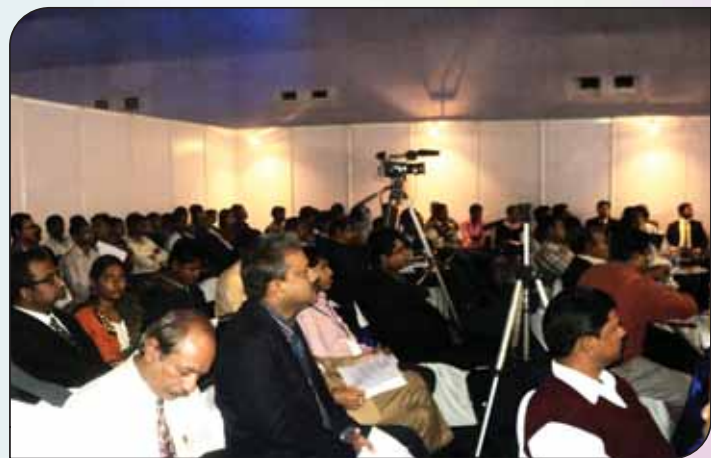
▲ The packed seminar hall during the Panel Discussion on Electronics Manufacturing in India - Chartering new course

THE BENGAL CHAMBER AND THE EUROPEAN BUSINESS AND TECHNOLOGY CENTRE (EBTC) PARTNERING JADAVPUR UNIVERSITY IN PRESENTING THE LECTURE SERIES ON SUSTAINABILITY OF INDIAN ENERGY SECTOR: PROSPECTS AND CHALLENGES", INAUGURAL SESSION