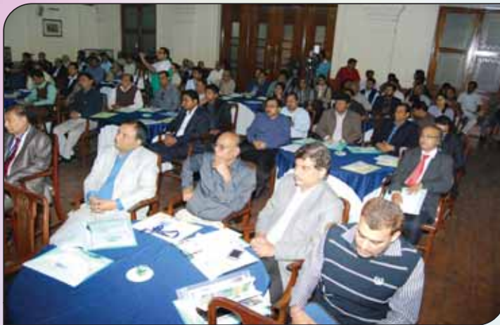
▲ Delegates at the E & NE India Infrastructure Summit.