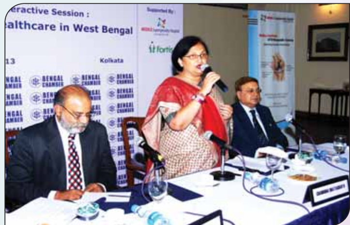
▲ Keynote address by the Chief Guest.