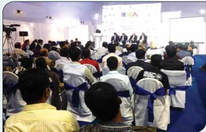
▲ The Audience during the Session on "Tourism Strategy in West Bengal".