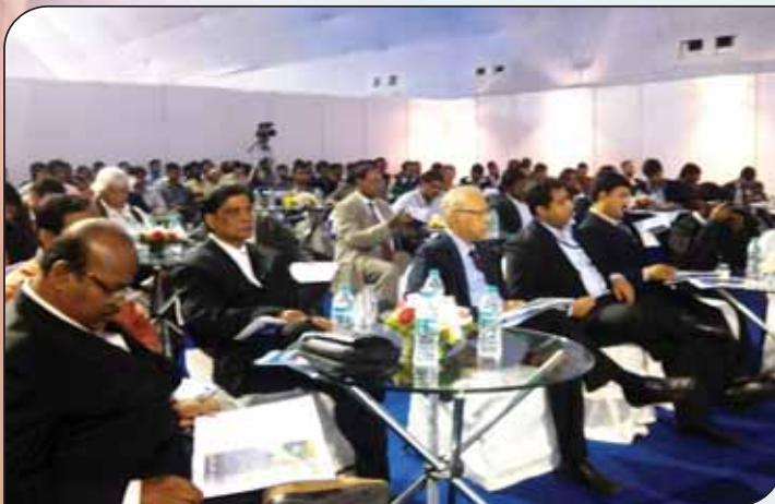
▲ The packed seminar hall.