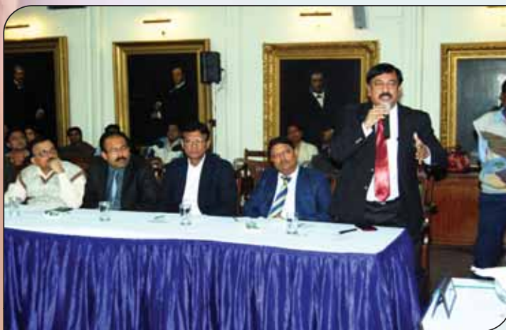
▲ Q/A Session in progress.