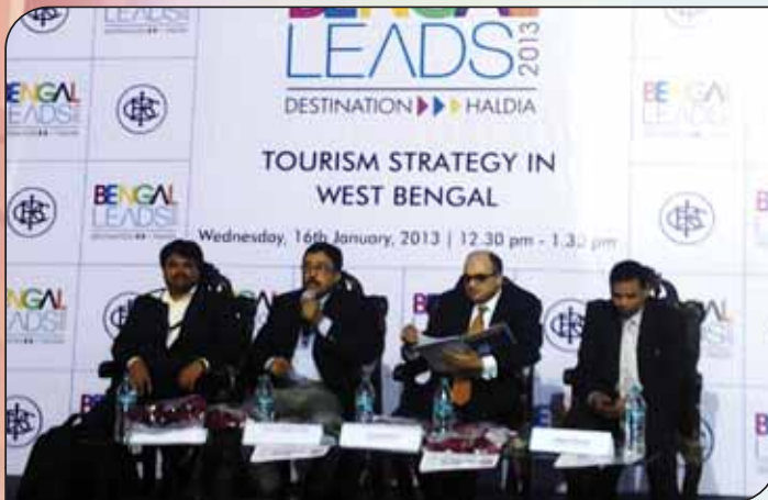
▲ The Session on "Tourism Strategy in West Bengal".