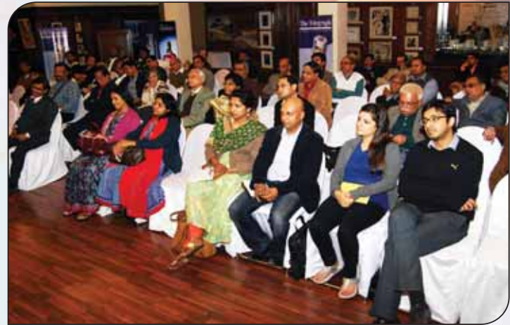
▲ A cross-section of the audience.