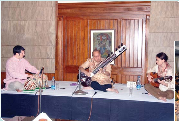
An evening of fusion music with Pandit Subroto Roy Chowdhury and The Brooklyn Duo