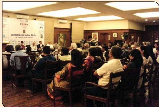
▲ The session in progress