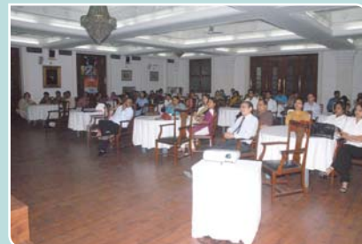
▲ The seminar in progress.