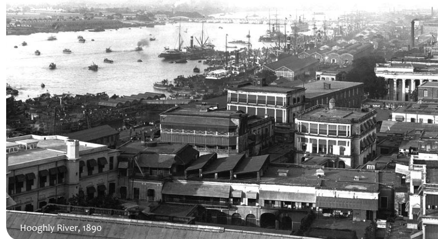
Hooghly River, 1890

There had to be cooperation and a full and frank understanding or literally nothing. Happily both sides opted for cooperation, and thus there opened another and not unfruitful chapter in the long story of Indo-British relations. Before looking briefly at some of its main heads, as they appear in the contemporary records of the BENGAL CHAMBER, it may be stated that the policy of the Government of India has been that non-Indian interests operating within India should enjoy 'national treatment'. In point of fact the accelerated process of disinvestment, referred to in an earlier chapter, has meant that in