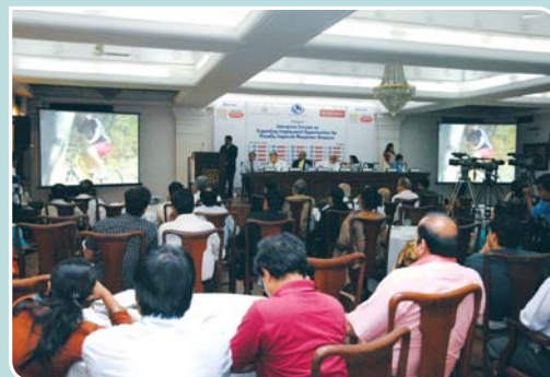
▲ The programme in progress.