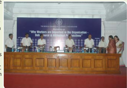
QC Team of Exide, Haldia after their presentation.