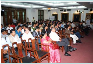
The participants and guests during the Preliminary Round.