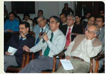
The Q/A in progress.

The programme was attended by senior corporate executives and members of the media and concluded with an Open House Session.