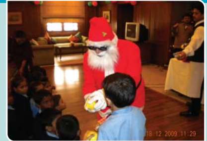
Special Christmas Programme for underprivileged children