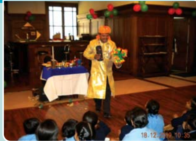
18th December 2009