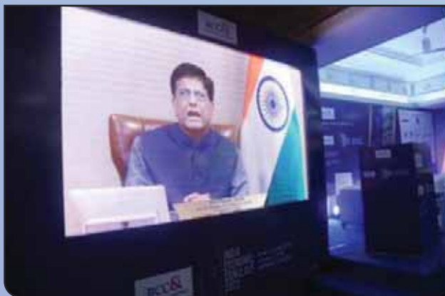
Chief Guest of the Conclave- Shri Piyush Goyal, Hon'ble Minister of Commerce & Industry, Consumer Affairs, Food & Public Distribution and Textiles, Government of India delivering the Keynote Address (Video Address)