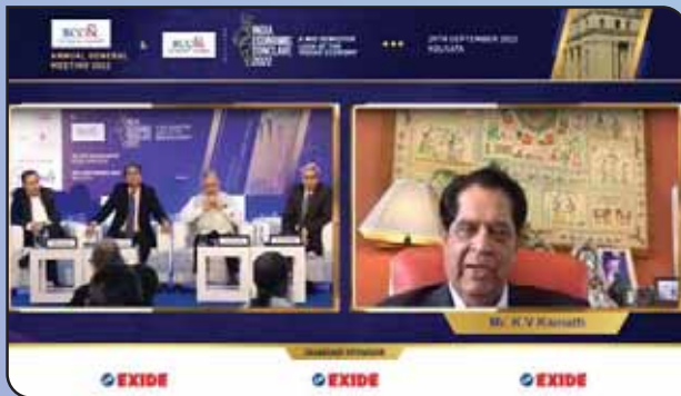
Mr. K V Kamath, Former Chief, New Development Bank of BRICS and Former Chairman, Infosys and Former Non-Executive Chairman, ICICI Bank (Virtual) addressing the audience virtually