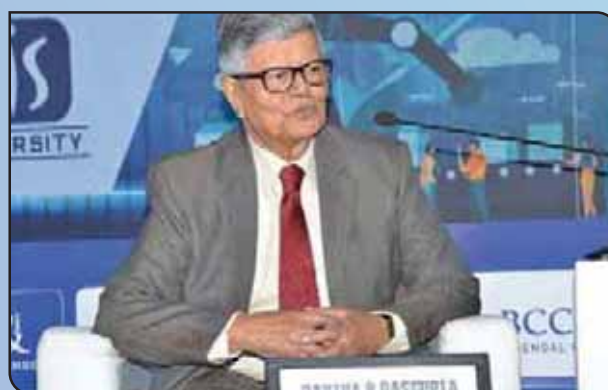
Dr. Partha R Dasgupta, during his speech