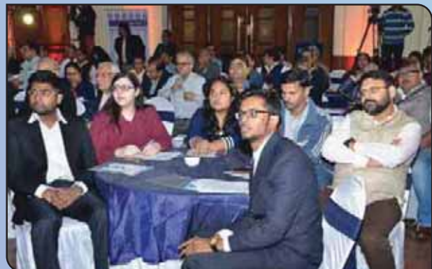
Section of Audience at the seminar