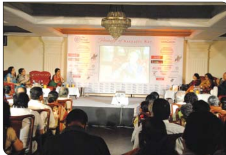
▲ The Adda in progress.