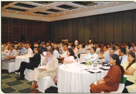
▲ The audience.