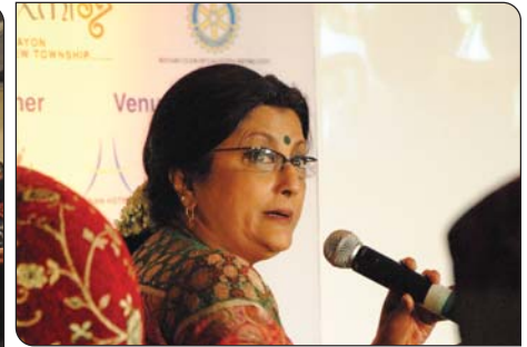
▲ Smt. Aparna Sen, filmmaker, actor and a leading lady of Ray Classics making a point during the Adda.

The Bengal Chamber of Commerce and Industry and "Onnomon" organized a unique Adda session, "Heroines of Satyajit Ray" at 6.30 p.m. on Saturday, 11th September 2010 in the Chamber premises. We wanted to pay homage to the legendary filmmaker, Satyajit Ray and the event stood testimony to our endeavours on this front.