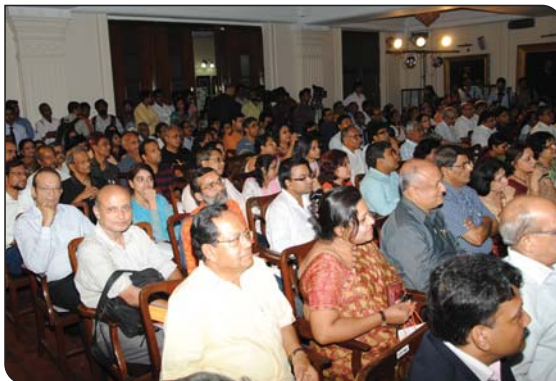
▲ The audience enjoying the Adda.