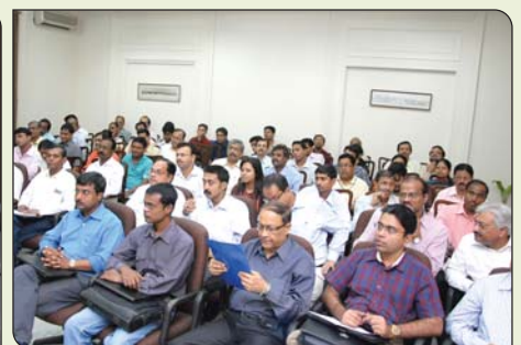
▲ The Session in progress.