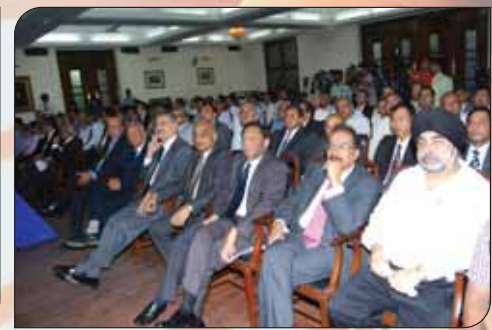
▲ Some of the distinguished audience comprising of the Chamber's Past Presidents, Chief Patron, Members of the Managing Committee, Chairpersons / Co-Chairpersons of Committees, Initiatives and Task Forces, representatives of the Consular Corps and senior members of the Chamber among others.