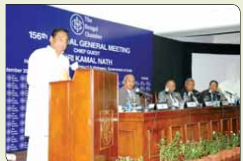
▲ Shri Kamal Nath addressing the audience