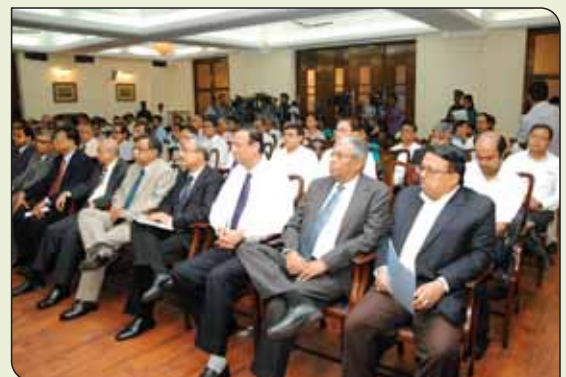
▶ The distinguished members of the audience