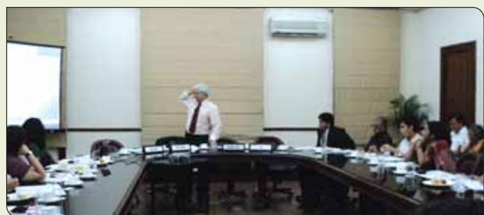
▲ Consultation in process