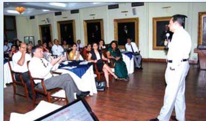
▶ During the Q&A session