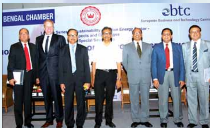
Press Conference in progress