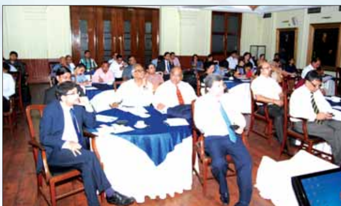
▲ A section of the audience