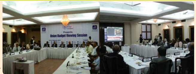
The session in progress

Members of the Bengal Chamber viewed the live telecast of the Union Budget as it was being presented by the Finance Minister in Delhi. This was followed by a Media Conference at which the Chamber shared its views on the Budget with members of the media.