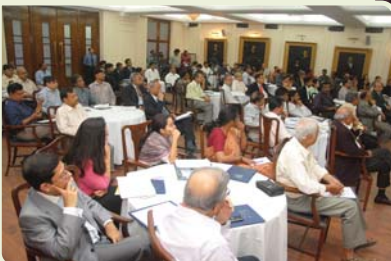
◀ The audience