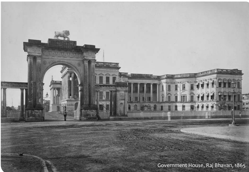
Government House, Raj Bhavan, 1865