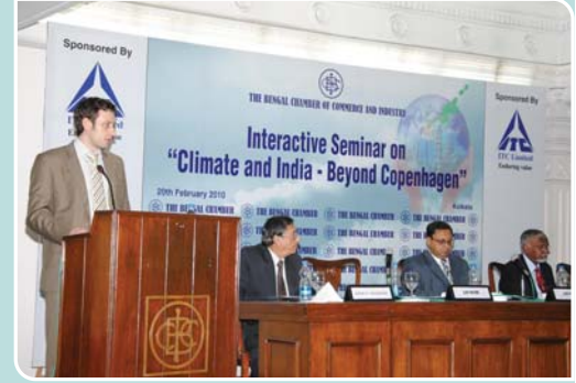
The programme in progress.

also headed the World Bank's Climate Change Team in Washington, DC.