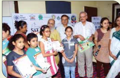
▲ With some of the participants with their certificates

A continuous endeavour of the Bengal Chamber has been to focus on sustainable development and to disseminate information and educate business, industry and society about the need for