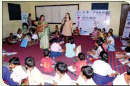
▲ The Sit 'n' Draw about to begin. The children are being explained the rules

schoolchildren on 5th June 2011 at the Rotary Sadan, Kolkata to celebrate World Environment Day. Through this event, the Chamber initiated its work with a very important segment of society, namely, schools. The Eastern Institute for Integrated Learning in Management (EILM) with Towards Life