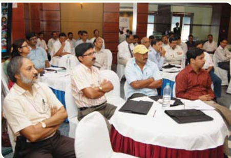
▲ The programme in progress.

The programme was presented jointly by the HR / IR Committee & the Durgapur Initiative of the Chamber. Durgapur Steel Plant (DSP), Steel Authority of India Limited partnered the Chamber in holding this programme, which was part of the Chamber's broader