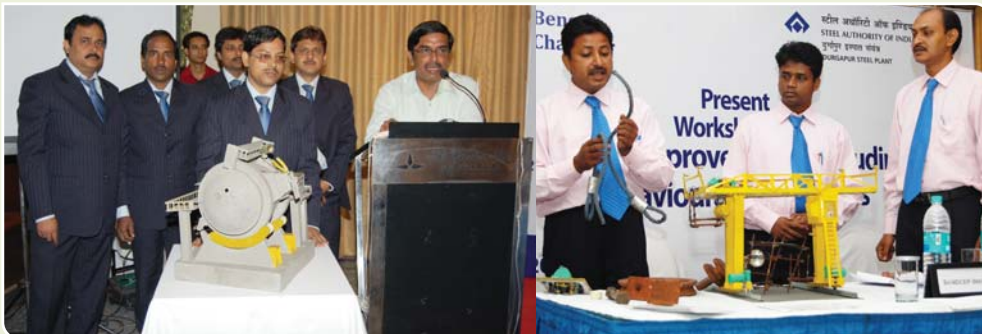
▲ The QC teams making their presentations