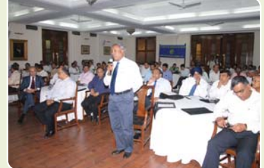
The interactive session in progress. ▶

21ST MAY, 2010, PEERLESS SAROVAR PORTICO, DURGAPUR