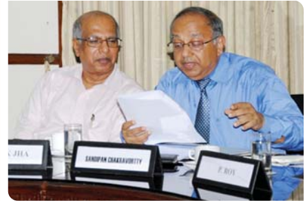
▲ The President explaining a resolution, with the Senior Vice President by his side.

An Extraordinary General Meeting (EGM) of the Chamber was held on 10th May 2010 at 6.00 p.m. in the Chamber premises. The purpose of the EGM was to consider amendments to certain Articles of Association of the Chamber. These amendments were related to induction of Chief Patron(s)/Patrons, raising the ceiling on maximum number of members, changes in certain nomenclatures and designations of Officers of the Chamber and miscellaneous changes.