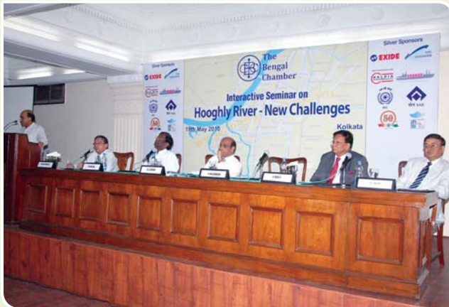
▲ The Inaugural Session in progress.

The Shipping Committee of the Chamber organized the Interactive Seminar on 'Hooghly River - New Challenges'.