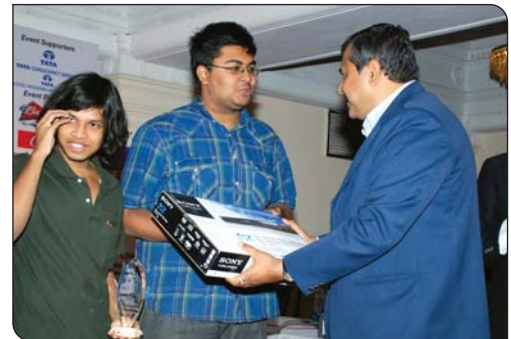
▲ Members of the team of students, "A Permanent Lapse of Reason" receiving their prize