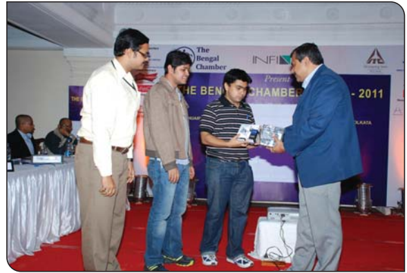
▲ Members of the team from Cognizant being awarded their prizes