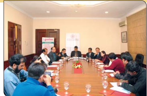
▲ The Media Meet before the commencement of the session