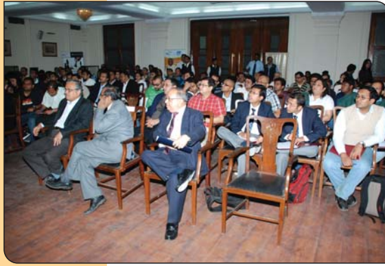
▲ Teams and the audience

The after-quiz party held in the Palladian Lounge featured "The Monkberries", which is a band creating waves in the local music circuit and is a regular at The Princeton. The band has a number of members working in the IT sector.