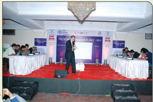
▶ The finals in progress