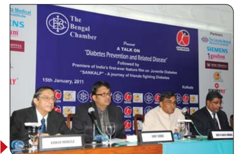
▶ The programme about to begin