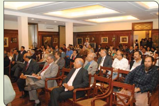
▶ A snapshot view of the appreciative audience