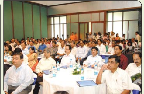
▲ The audience.