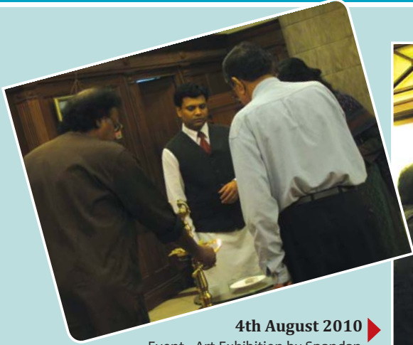
4th August 2010 ▶ Event - Art Exhibition by Spandan