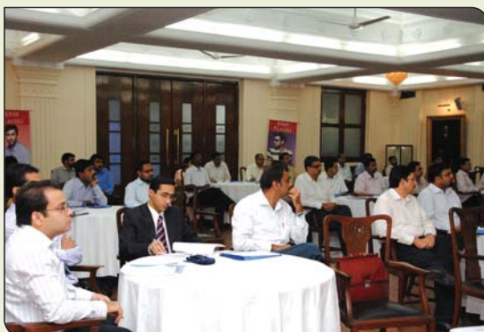
▲ A section of the audience