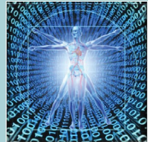
APPS AND ANALYTICS