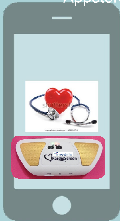
KARDIOSCREEN: MOBILE CARDIOLOGY